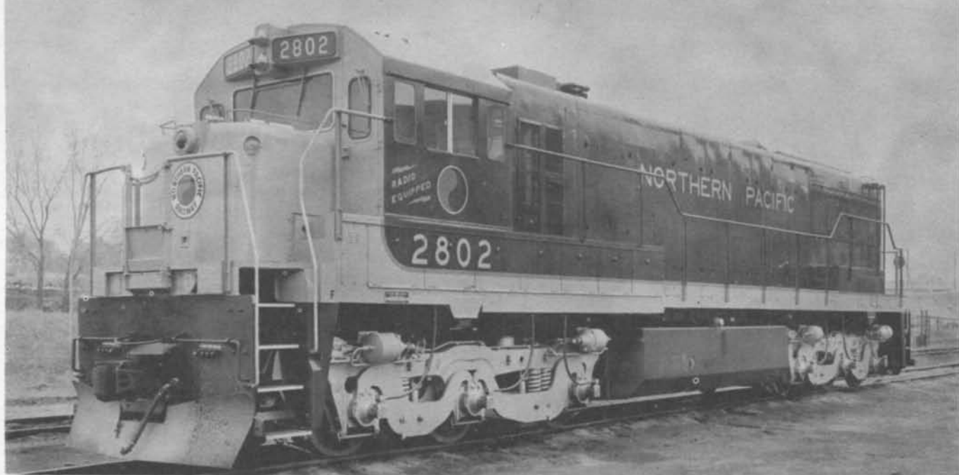
NEW U-28C diesel-electric unit arrives at St. Paul Mississippi St. shops for special equipment installation.