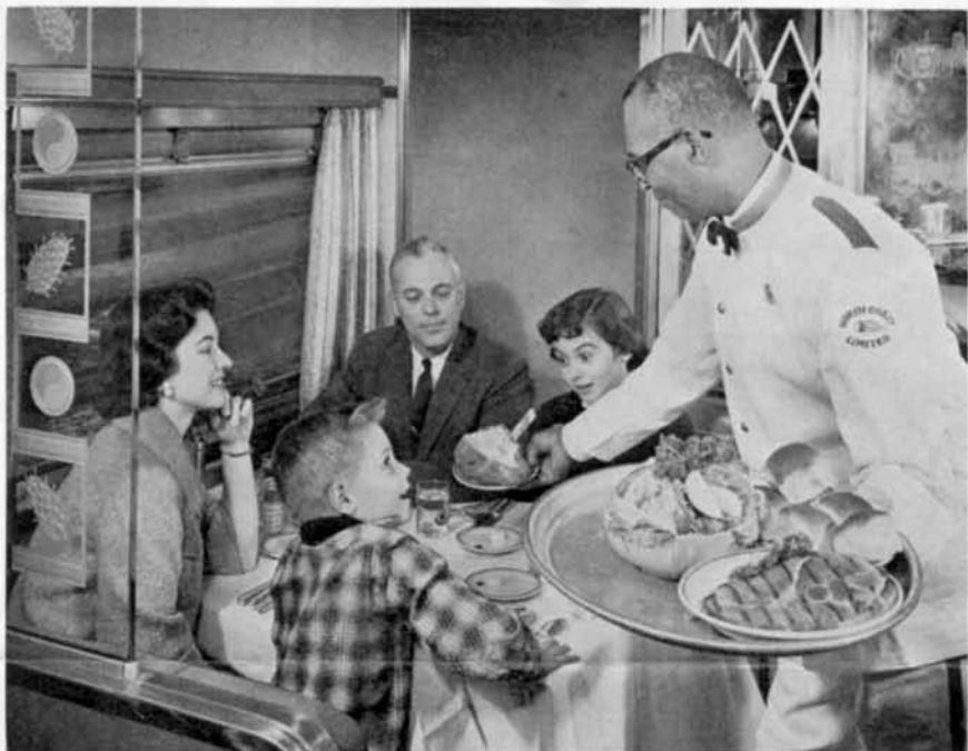
MEALS aboard the North Coast Limited diner are an adventure in good eating.