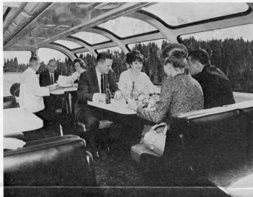
SNACK-TIME in the Lounge-In-The-Sky Dome car as the magnificent scenery rolls by in a continuing panorama of beauty.