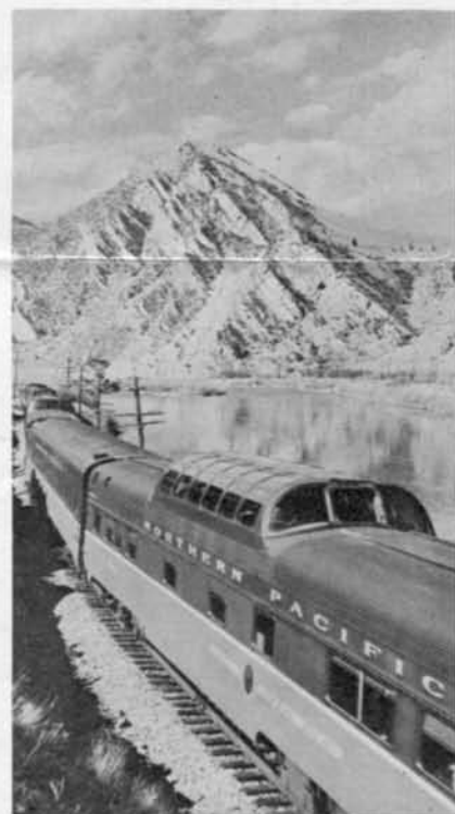
VISTA-DOME NORTH COAST LIMITED in the Rocky Mountains.