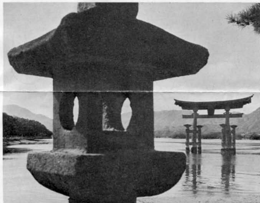
JAPAN, noted for its shrines, temples and gardens is truly one of the scenic wonders of the world.