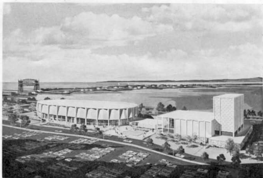
OVERLOOKING TWIN PORTS' famous ship canal and Aerial Lift bridge, new Duluth arena-auditorium is situated on the shore of beautiful Lake Superior. Now in operation, the $6.1 million complex offers finest in convention and entertainment facilities in Northland area.

Schweitzer Basin is located outside Sandpoint, Idaho, just an overnight train trip from Portland, Tacoma and Seattle via Northern Pacific.