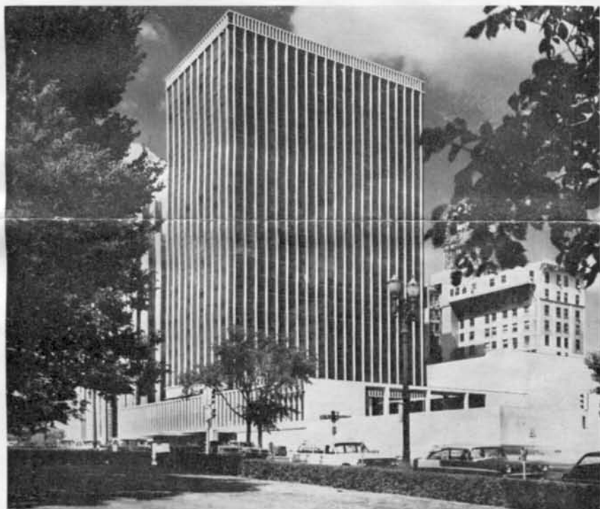
NEW SAINT PAUL HILTON , framed by trees on Kellogg Blvd. in downtown St. Paul, opened in August. The 24-story, 500 room hotel features a scenic elevator, outdoor swimming pool, and five restaurants among its many outstanding convention facilities.