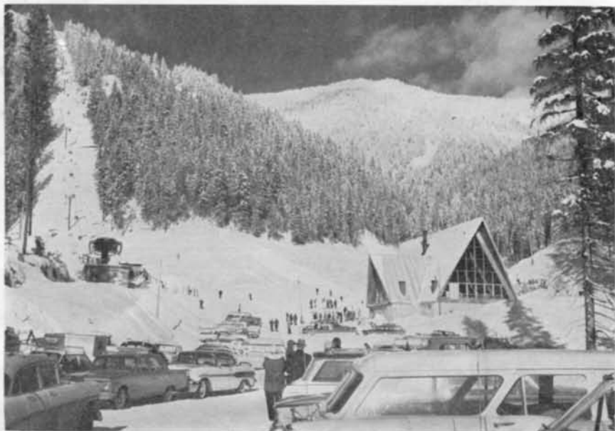
LOOKING UP BIG SKY Mountain from the foot of Missoula Snow Bowl is the central A-frame chalet which contains ski shop, ski school headquarters, lunch facilities, ticket sales and plenty of room to stretch and relax. From here, skiers take a Riblet double chairlift up to High Park for gentler slopes, or continue to the summit for exciting runs over a 2,600-foot vertical drop to the bottom.