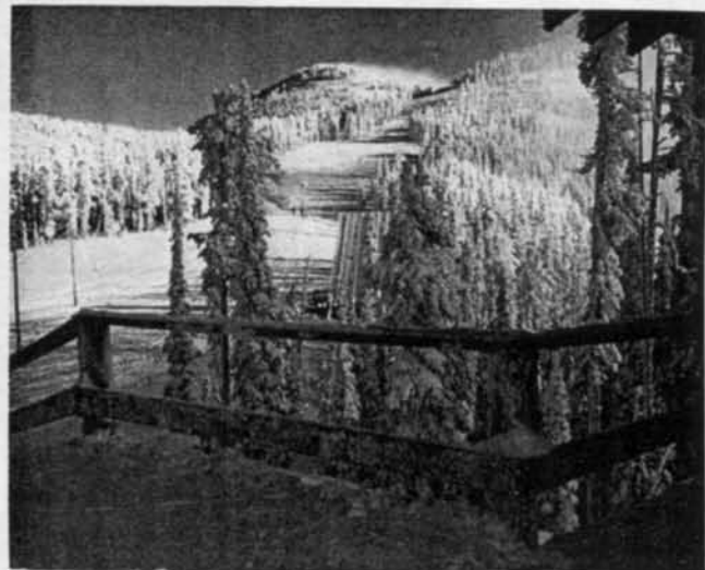
MISSOULA SNOW BOWL setting up on High Park plateau (7,012 feet above sea level) is one of fantasy-land beauty. The upper chalet is conveniently located nearby the lift station ramp.