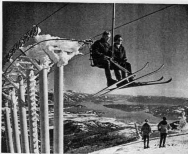
SCHWEITZER BASIN double chairlift continues up to higher reaches as skiers stop to admire view of 65-mile-long Lake Pend Oreille far below. Schweitzer has 1,200 acres of varied ski terrain.