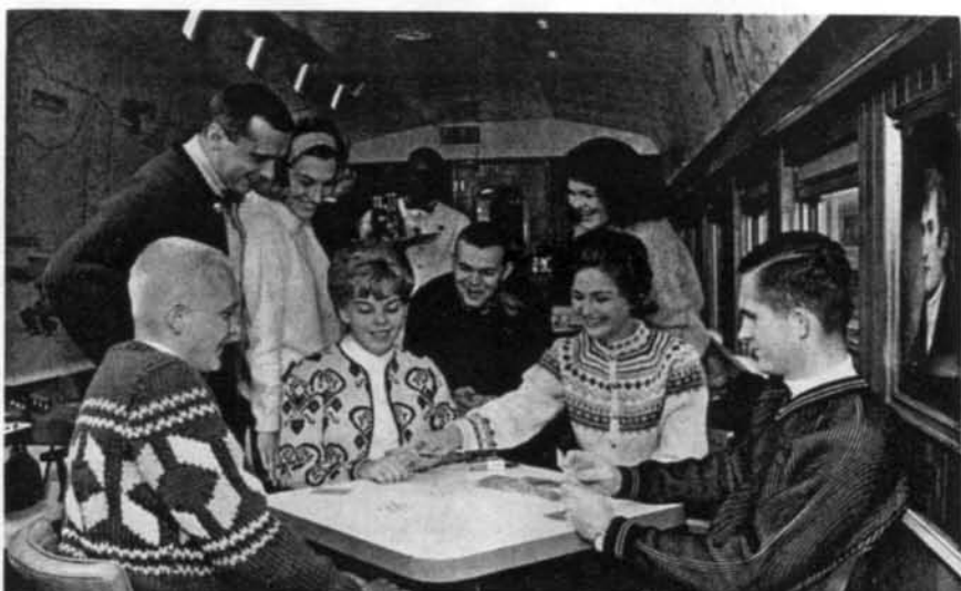
ABOARD THE NORTH COAST LIMITED —Rocky Mountain-bound skiers relax and enjoy themselves enroute in Northern Pacific's unique Lewis & Clark Travelers' Rest car. Murals and furnishings in this car are in the spirit of pioneer days in the Pacific Northwest. Dome cars and stewardess-nurse service are other "extras" on NP's crack streamliner. When large groups of skiers book passage, the NP also sees to it their skis are placed in special racks near their coach seats.