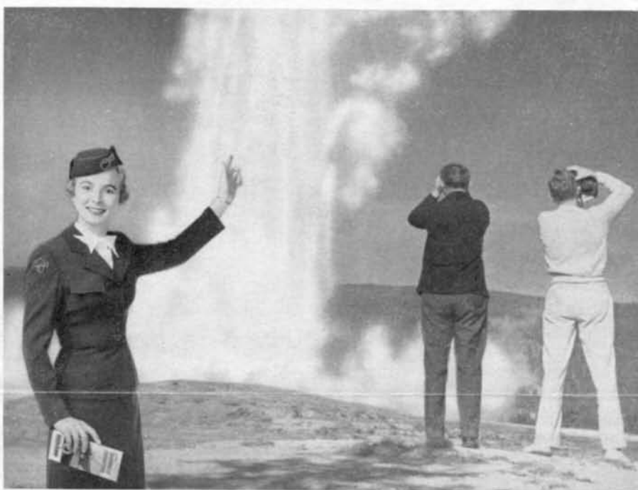
Old Faithful Geyser

The Oakland, Calif., Tribune reports that, "Geographically speaking, there's confusion at 14th and Bdwy. The Easton Building is south of the First Western Building. The Central Building is north of the Easton Building and the First Western. But, although the Northern Pacific Railway is in the Central Building, it's north of the Southern Pacific, which is in the Trib Tower."