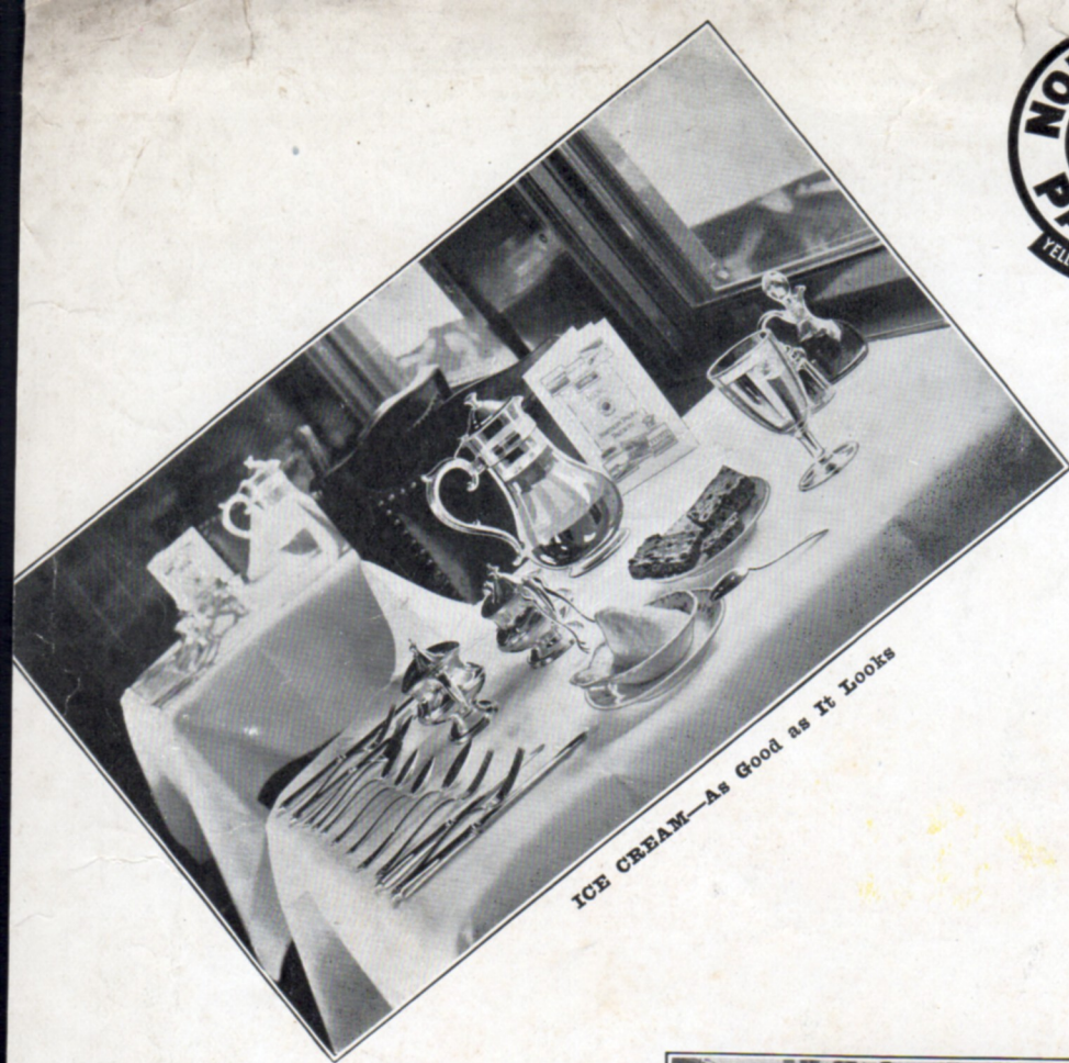
ICE CREAM—As Good as It Looks