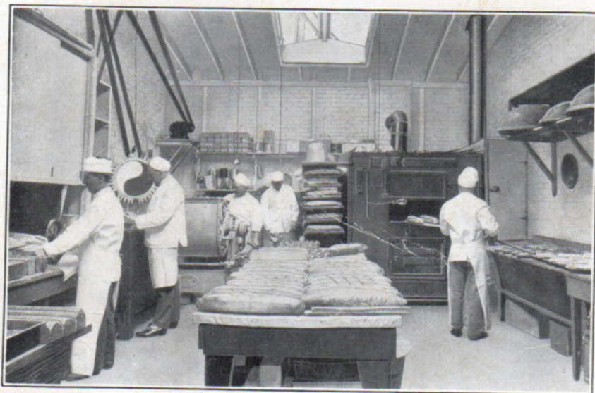
OUR OWN BAKE SHOP—Where All Our "Goodies" Are Made