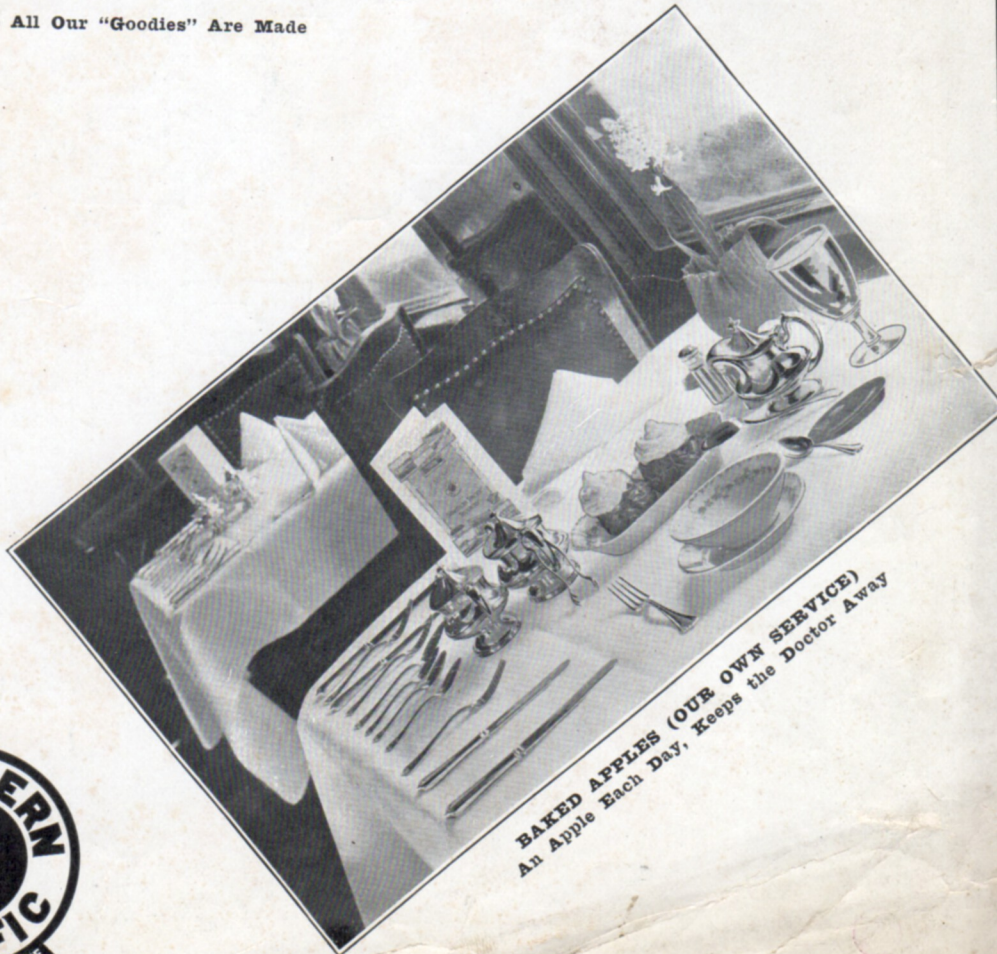
BAKED APPLES (OUR OWN SERVICE) An Apple Each Day, Keeps the Doctor Away