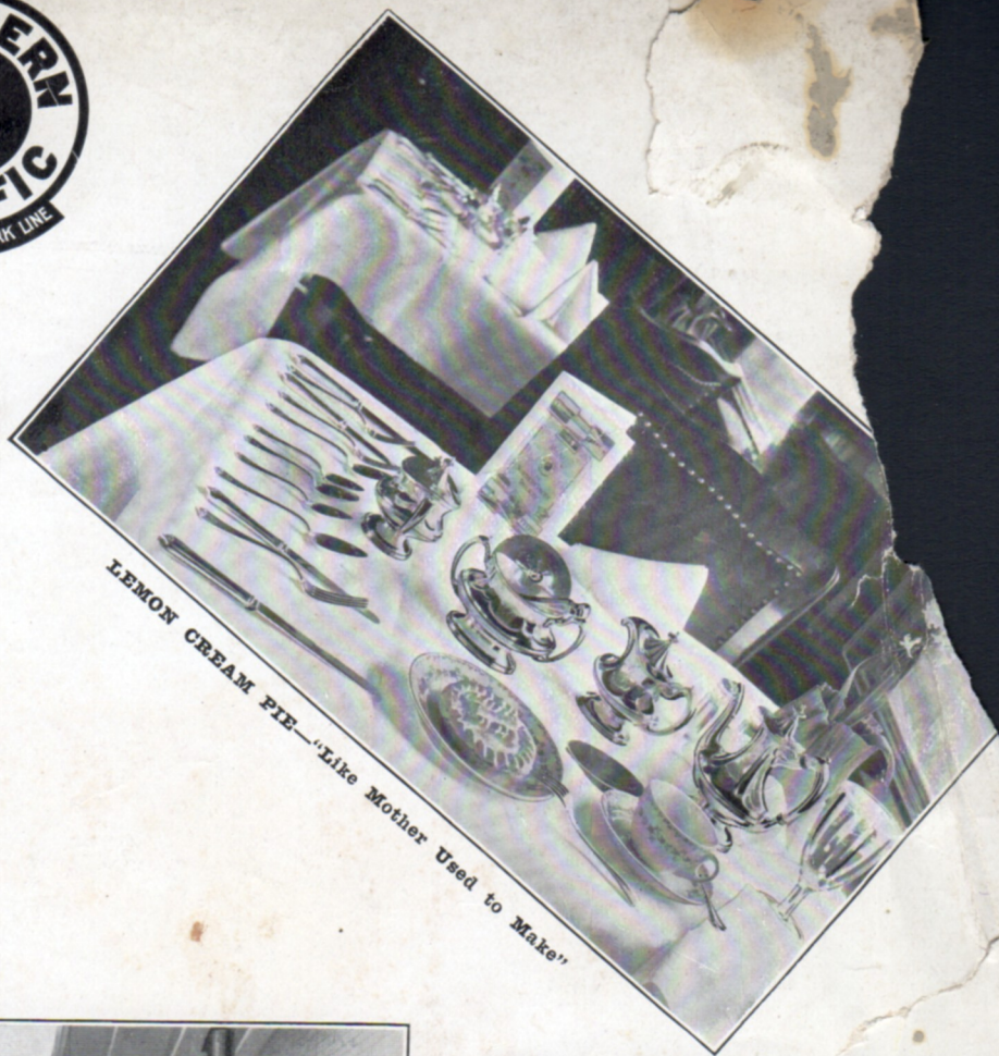
LEMON CREAM PIE—"Like Mother Used to Make"