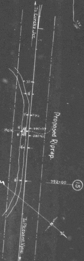
Location Sketch Scale: 1"=100'