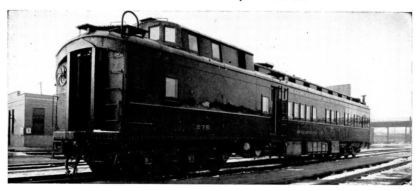
Fig. 874—Northern Pacific All-Steel Dynamometer Car Built at Como Shops, St. Paul, Minn., Weight 168,000 lb.; Capacity for Drawbar Pull of 250,000 lb. and Buffing Shock of 1,250,000 lb.

(Railway Age, Feb. 9, 1929—Railway Mechanical Engineer, Mar., 1929)